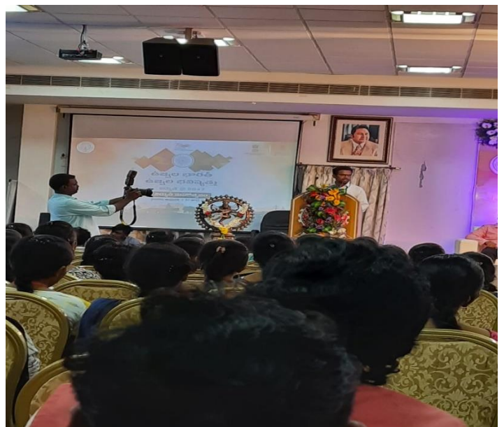
Lecture Delivering by Resource persons